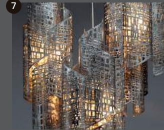
LAMPS AND LIGHTING - Ranging from traditional to contemporary designs, the lamps and lighting pieces in Manila FAME offer a myriad of options to create an ambiance of sophistication and elegance.