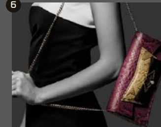
FASHION ACCESSORIES & WEARABLES - Fresh, artisanal, and consistently evolving creations of the Philippine fashion industry. It is a statement to the growing globalization of the Philippine fashion design sector that marries artisanal crafts and contemporary sensibilities in every piece.