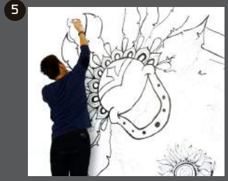
VISUAL ARTS - Showcasing novel and avant-garde creations and contemporary art from the country's top visual artists.