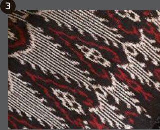
TEXTILES AND HANDWOVEN ITEMS - Handmade products that embody the Philippines' distinct character and rich inventory of traditions and talents. The pieces are a testament to the skills of local artisans and craftsmen in weaving, wood, carving, metal forging, marquetry, and other traditional crafts.