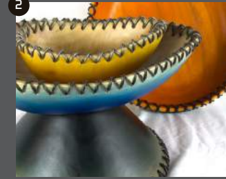
HOME ACCENT - Products that provide color, texture, and ambiance to any interior space, these pieces are made to bring life and personal touches to any room.