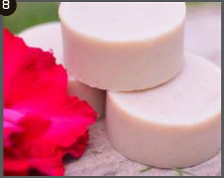
GIFTS & PREMIUM ITEMS - A diverse selection of health and wellness, personal care, and gourmet gift items manufactured by leading local companies.