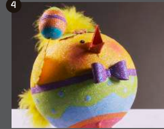
FESTIVE & SEASONAL DÉCOR - Decorative items that reflect the creative excellence of the Philippines' holiday and home décor industry. These whimsical items deliver a vibrancy reflective of the Philippines' joyful nature.