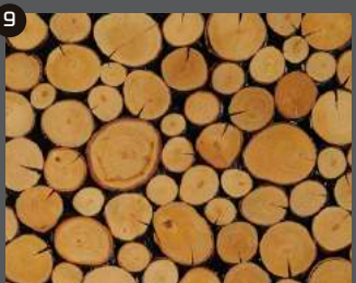
INTERIOR & ARCHITECTURAL COMPONENTS an assortment of items for interior and architectural professionals, catering to projects for the contract and hospitality market.