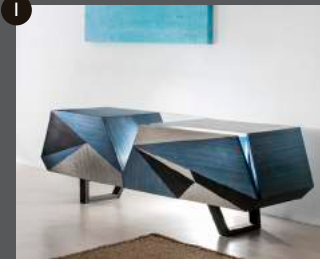
FURNITURE & FURNISHINGS - Contemporary items that connote sophistication, elegance, and style. Made from a variety of different materials, the pieces showcase the versatility of Philippine materials and design for a modern setting.